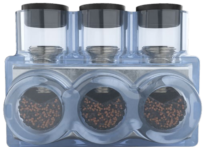
Conductor insertion and oxide inhibitor presence can be visually verified after installation.